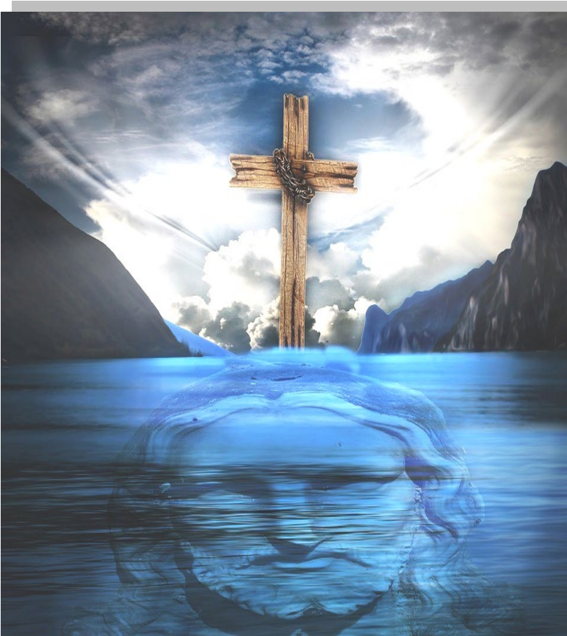
Water is the Answer